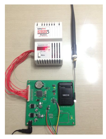
Figure 2. Connection of Siren Pro 3 and WCDMA module