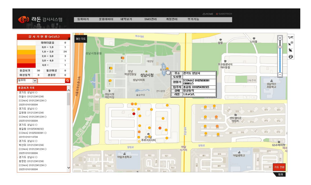
Figure 5. Street view of Seongnam city