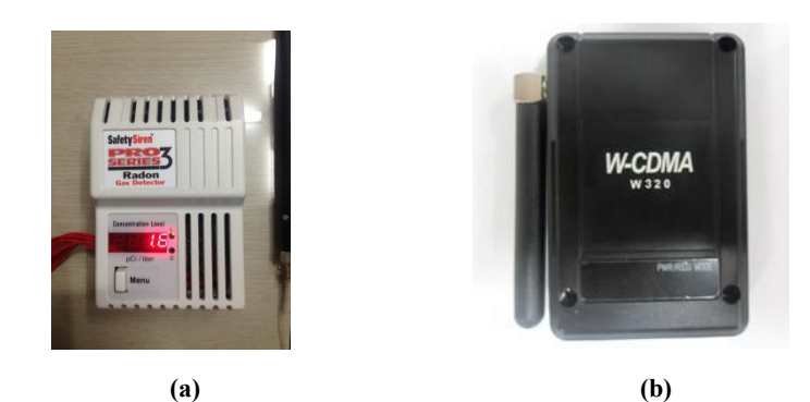
Figure 1. Safety Siren PRO 3 radon gas detector and WCDMA(KEM-W320)

This paper presents the development of a radon concentration monitoring system, which uses the Safety Siren Pro Series 3 Radon Detector for detecting the radon particles and a data processing module with WCDMA communication capabilities for measurement results transmission and management as shown in Fig. 1 (b). The protocol is 3G WCDMA. The frequency is about 2GHz. The interface is 24pin receptacle type (UART/USB/power) and 40pin board-to-board connector. The connection of Siren Pro 3 and WCDMA module is shown in Fig. 2.